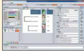
1. Easy to follow icons enable intuitive and user-friendly operation