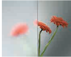
Clearvision Highly transparent float base for pure aesthetics