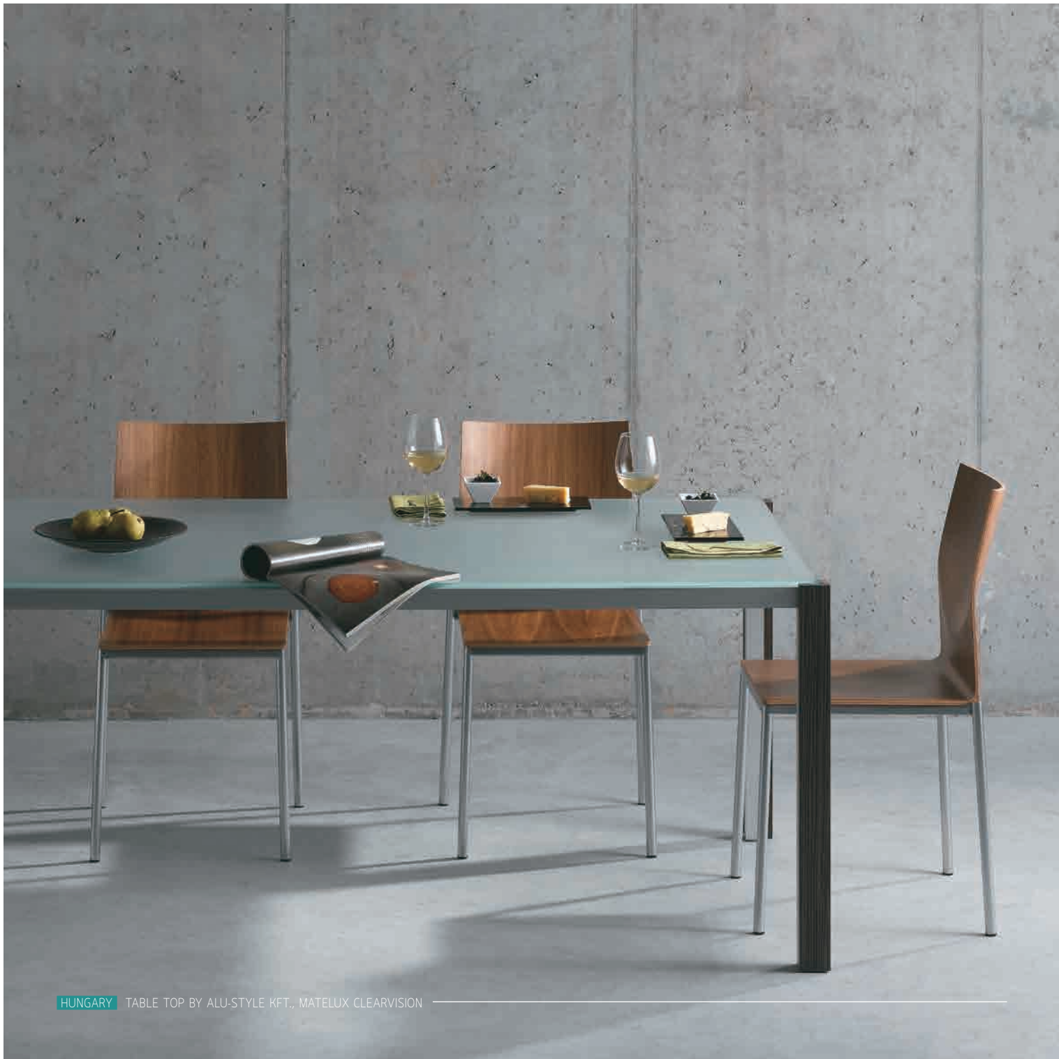
HUNGARY TABLE TOP BY ALU-STYLE KFT., MATELUX CLEARVISION