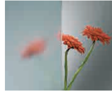
Linea Azzurra Slightly blue tinted float base