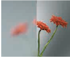
Clear Normal float base