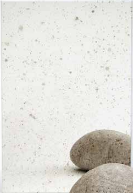
6MM & 4MM MAX SIZE - 2440MM X 1220MM