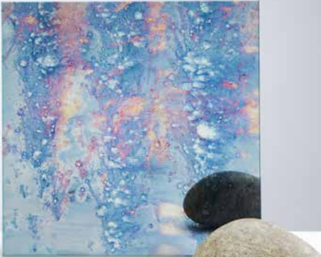
MAX SIZE - 3210MM X 2250MM